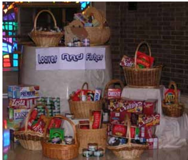
Discover Sunday School (Grades 4 & 5) Project

impressive display near the baptismal font. On Easter Monday Bill and Deandra Rousch delivered the collection to Operation Love for distribution through their food pantry. Thank you to all who participated!!