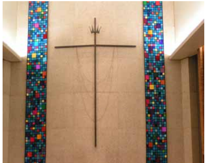
Our NEW Sanctuary banners were dedicated on Sunday, April 15.